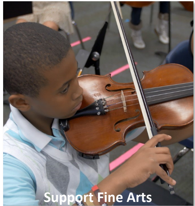
Support Fine Arts

Non-refundable donations are eligible for the Arizona State Income Tax Credit as allowed by ARS §43-1089.01. Please consult with your personal tax preparer to determine the application of this credit. Donations must be received by April 15, 2024 to be eligible for a 2023 Tax Credit.