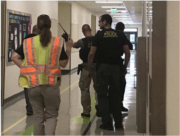
(above: Phoenix Police officers were trained on handling school emergencies using Laveen facilities outside of school hours).

Laveen schools practice for a variety of emergencies multiple times a year. The procedures they follow were developed in partnership with law enforcement and crisis experts and are based on best practices in emergency response. School safety committees evaluate the success of every drill and practices are continuously reviewed and refined.