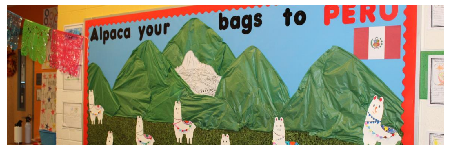
Paseo Pointe celebrates Hispanic Heritage Month with annual parade

Paseo Pointe held their annual parade in celebration of Hispanic Heritage month.